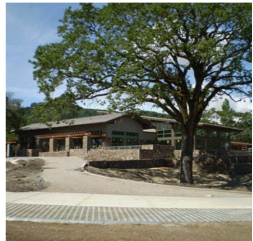
Figure 44. Example of a project that utilized native trees and extended eaves for natural cooling.