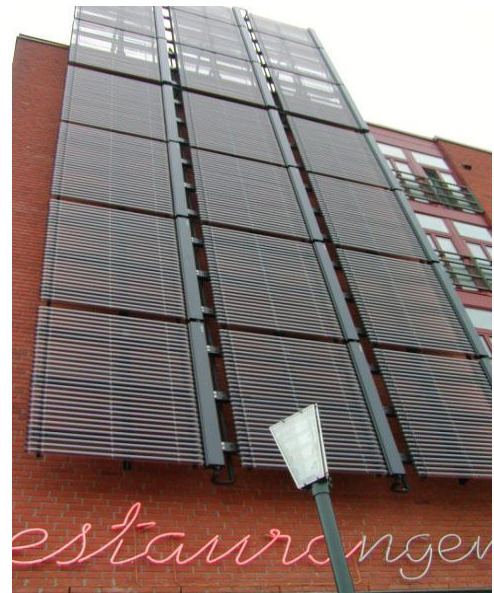
Figure 43. Building design features such as screens help improve environmental quality