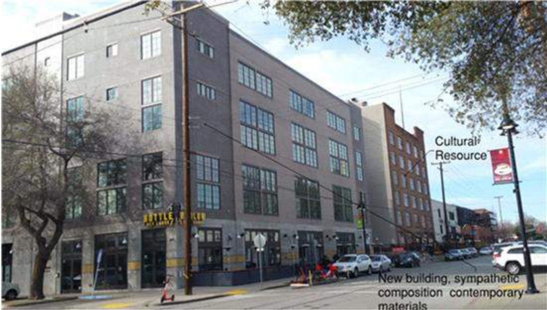
Image A. R Street Historic District, Sacramento, CA