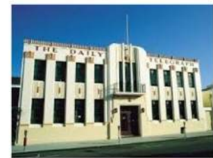
Deco Period 1925-1940 Stylistic Reference