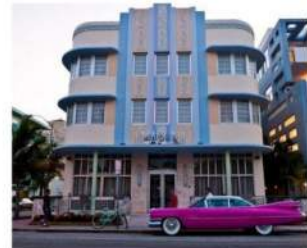
Deco Period 1925-1940 Stylistic Reference