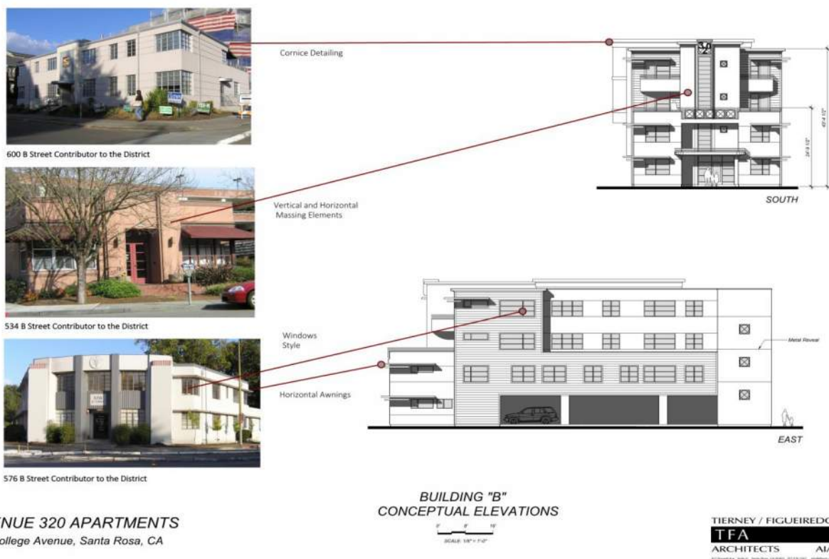
FIGURE 3 & 4. District- Character Defining Elements referenced in new design & Historic References used