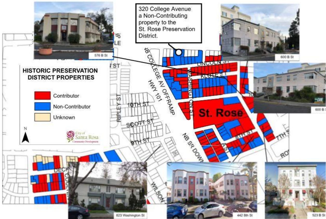
FIGURE 1. Character Defining Elements, as represented in applicable contributors within the St. Rose district.

Conversely, contrasting buildings have received approval in other instances, but one has to be careful as too many contrasting buildings are often equated with erosion of the district fabric, or artificiality. Thus, a building of this scale, as allowed by the CD-5-H-SA zoning district standards, is encouraged by the City of