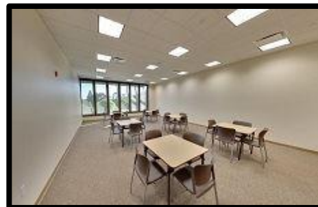
Room 21 Pictured