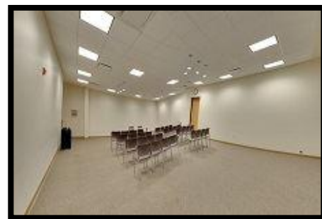
Room 1 Pictured